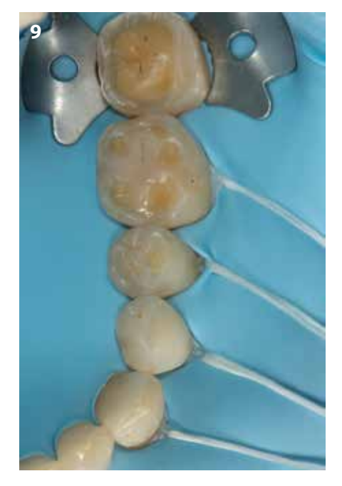
Fig. 9: The teeth were isolated with rubber dam prior to the adhesive procedure.

Prior to the polishing, the sprue and surface irregularities due to composite overflow were removed with abrasive disks, fine diamond burs, interdental strips, and stones (Fig. 17). The occlusion was carefully checked, and premature