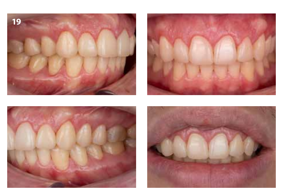
Fig. 19: Treatment result. With careful treatment planning and a reliable procedure, excellent morphology and balanced occlusal contacts were obtained with direct composite.