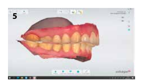
Fig. 5: Intraoral scans of the initial situation.