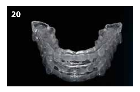
Fig. 20: Occlusal night guard.

Fig. 19: Treatment result. With careful treatment planning and a reliable procedure, excellent morphology and balanced occlusal contacts were obtained with direct composite.