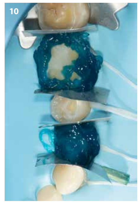
Fig. 10: Teeth were separated with metal matrices prior to sandblasting and selective enamel etching.