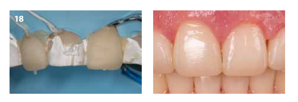
Fig. 18: The layer line pattern copied from the 3D printed model can be removed with simple polishing procedures.

structure needs to be preserved.<sup>15</sup> The composite injection technique fulfils all these requirements. The treatment is minimally invasive, with minimal preparation requirements and an easily repairable material.<sup>16,17</sup> Moreover, adjustments can relatively easy be made in a later phase if necessary,